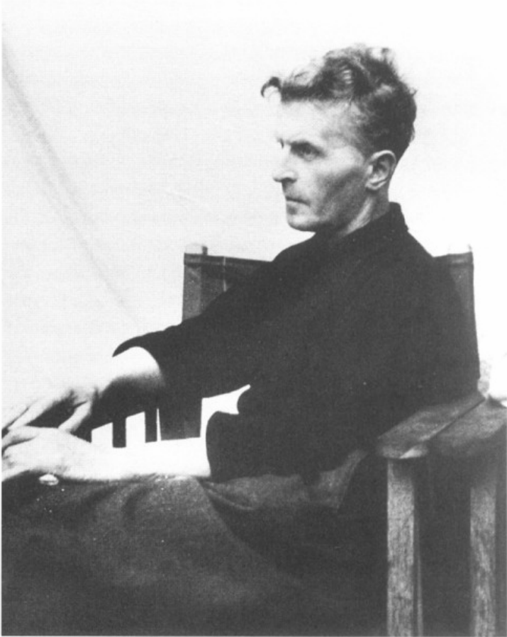
5. One of the last photographs of Wittgenstein, in the garden at the von Wrights' home in Cambridge with a bedsheet draped behind him for a background.